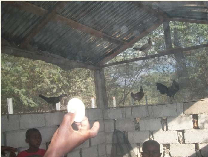
Above: Children at the Williamson compound show off the new chicken coop constructed with the help of the team from Nebraska. They report that they are already collecting eggs, which improves the protein in the childrens' diets, and gives the kids some "chores" to do.