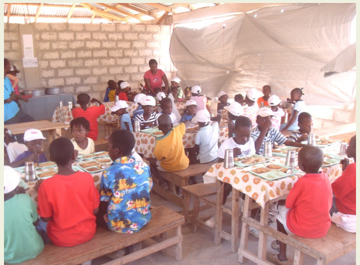
Below: Children eat lunch in the newly constructed cafeteria at the Valley House of Hope. This multi-purpose building also serves as a classroom and a church sanctuary.